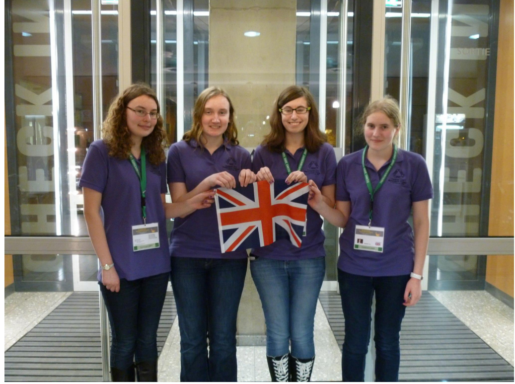
Figures 6 and 7